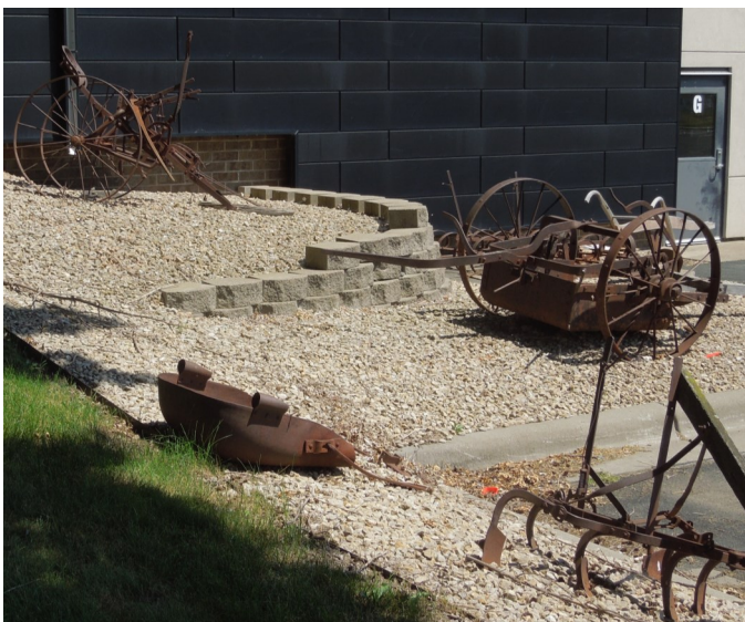
Vintage farm equipment outside museum and cows from past displays