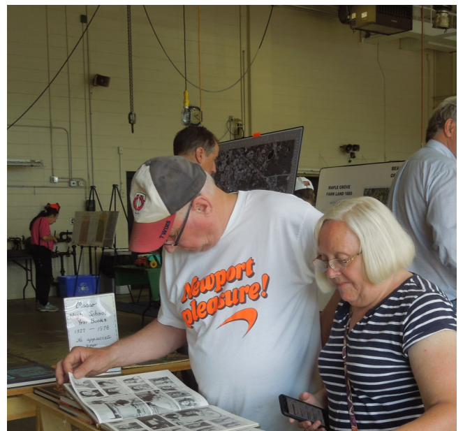
The vintage school room displays and the visitors enjoying the Osseo High School year books.