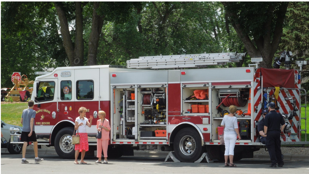
Maple Grove Fire Truck