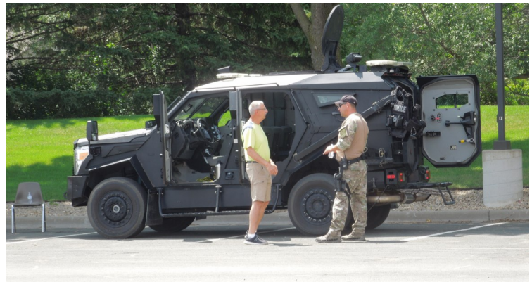
Maple Grove SWAT vehicle