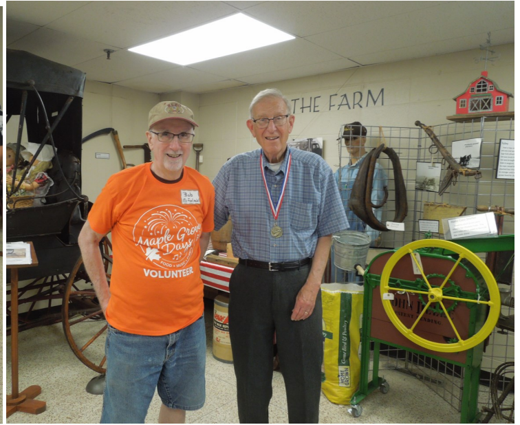
Visitors enjoying the open house