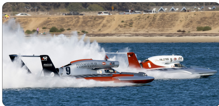
Miss Tri-Cities (right) and its teammate on the Strong Racing Team, the U-9 Pinnacle Peak Consulting , should be in the hunt all season, sez the Swami.

SWAMI SEZ: Much off-season work should make this boat even better than last year. With the all-time leader in race victories doing the driving, the threat to win is there at every race. Recent test in at the Vancouver exhibition showed some dramatic speed and smoothness