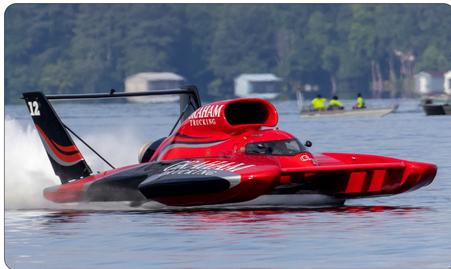
The Swami sez Graham Trucking should win many preliminary heats this season and should make all of year's final heats.

SWAMI SEZ: The team at times found all kinds of speed in 2021 and if it can stay consistent, watch out with a victory being a possibility. For the most part it will be second or third in the preliminary heats and will appear in most finals.