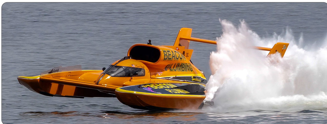
Lots of off-season improvements should make Miss Beacon Plumbing a threat to win at every race.

first time out. If things align, this team could have a championship.