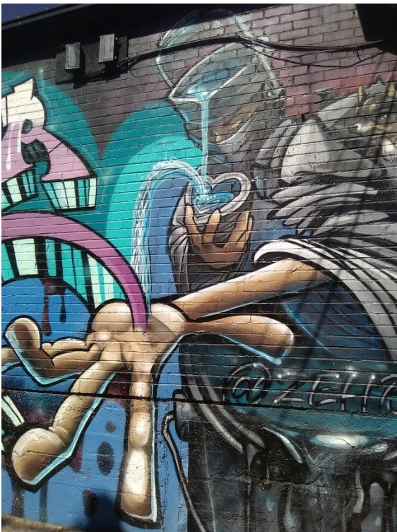
Paint pours from the Buckethead in this alley mural.