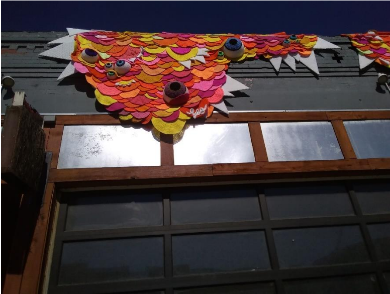
The Lady's Fancywork Society created this hanging of brilliant crocheted overlapping yarn circles.