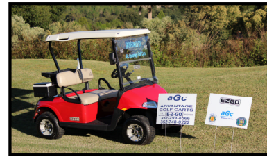
Advantage Golf Carts [E-Z-Go]

The day ended with everyone leaving appearing to have had a great time.