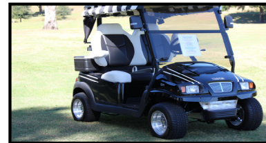
Cart World [Club Car]

We thank our hole-in-one sponsors, mentioned on the right, along with their contribution, for their generosity in sponsoring our tournament.