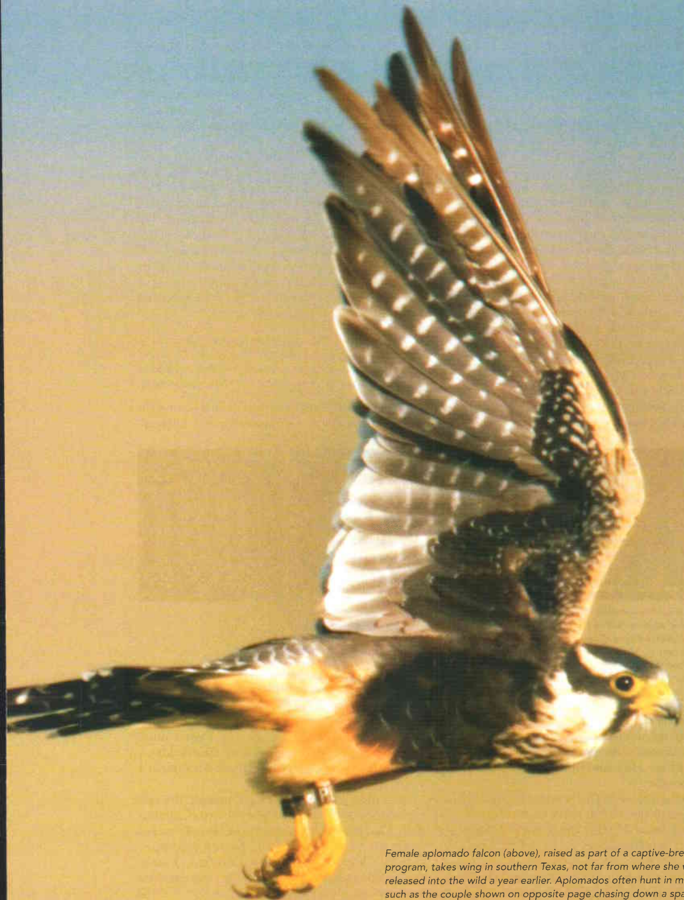
Female aplomado falcon (above), raised as part of a captive-breeding program, takes wing in southern Texas, not far from where she was released into the wild a year earlier. Aplomados often hunt in mating pairs, such as the couple shown on opposite page chasing down a sparrow.