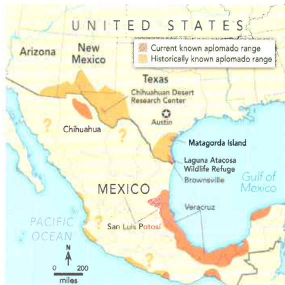
Current and historically known ranges of aplomados in the U.S. and Mexico are plotted above. Colored question marks indicate historical ranges that are not well documented. The small areas in Texas marked as current ranges are regions where aplomados have been reintroduced. The species also occurs in Central and South America.

The savannas of coastal southern Texas seemed to offer the best chance for re-establishment. The region had included vast savannas at the time of the Spanish settlement in the 1600s. Brush invaded, though, and by the early 1900s, most of southern Texas was either developed as farmland or blanketed in brush. But even with such large-scale loss of habitat, aplomados bred just north of Brownsville, Texas, until the mid-1940s. The final loss of the species in southern Texas coincided with the arrival of DDT in 1947 for cot-