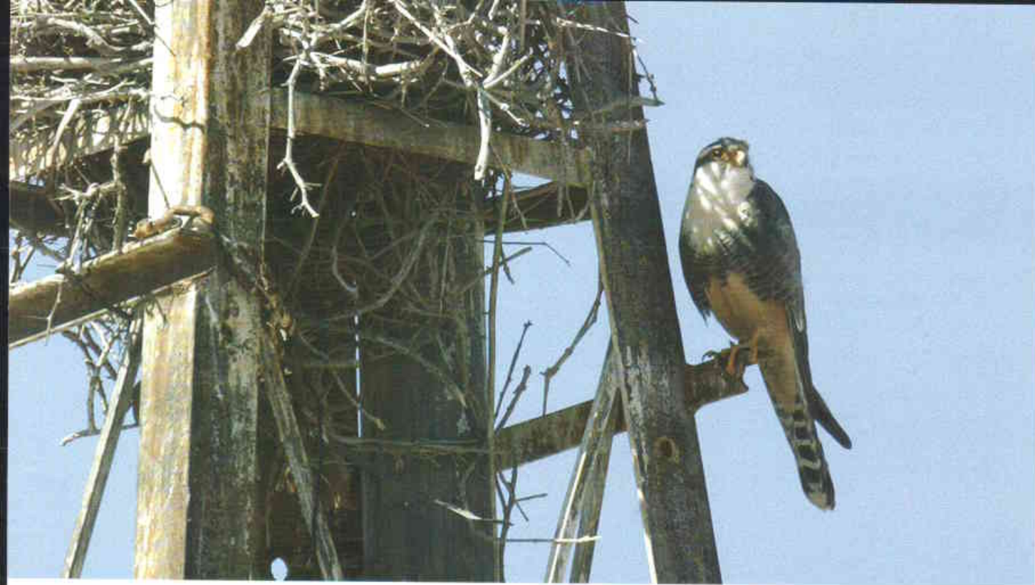
Adult aplomado perches next to a raven's nest that it has commandeered on an abandoned windmill, in the Mexican state of Chihuahua. Falcons do not build their own nests.

the bird's gray back, and ignores the beautiful cinnamon-orange markings on its head and belly.