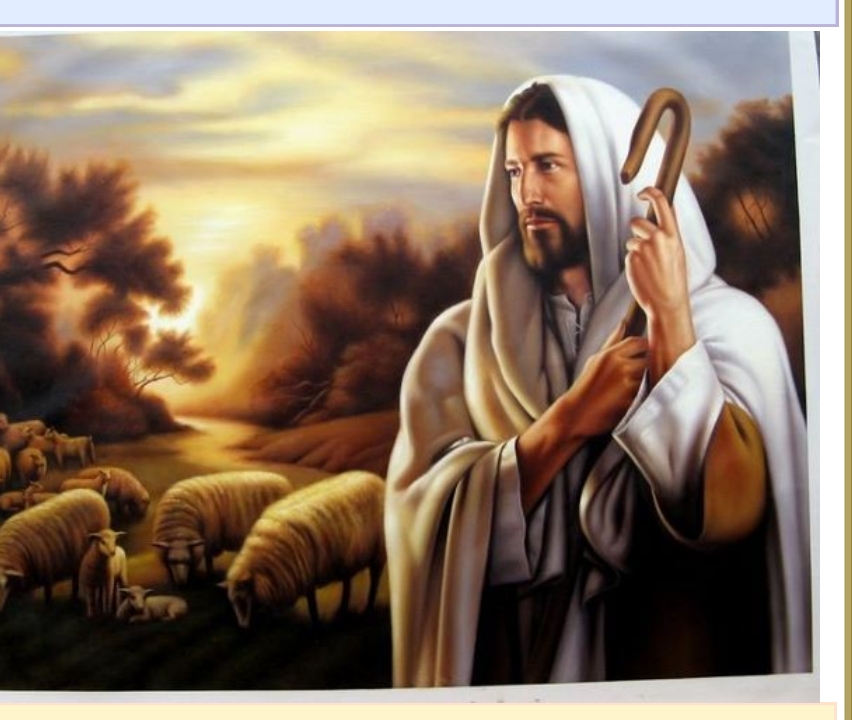
THEME: As a Shepherd Tends His Flock