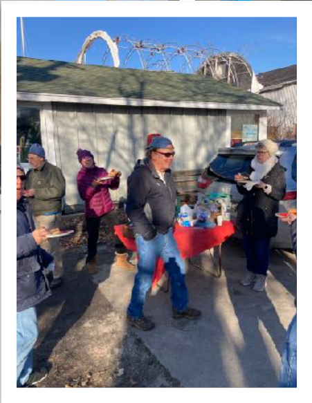
Swap Meet. Weeks Shipyard