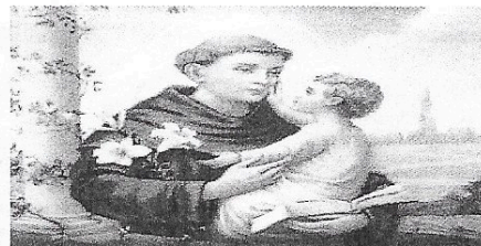
St. Anthony ~ Browns Valley