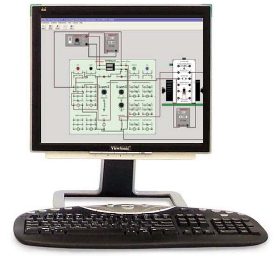
The Hampden SIM-200 Virtual Motors and Machines Software provides a "Virtual Workbench," allowing students to assemble, test and analyze a large range of equipment.

Instructor access to student progress reports and quick quiz results are password protected under the program maintenance menu. Optional network setup centralizes instructor database information.