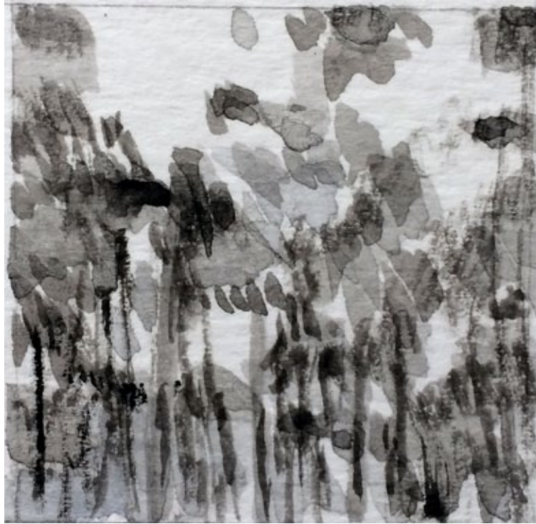
STAMP: BEHIND THE NEIGHBORS YARD, 2020, watercolor, 1.25 x 1.25 in. 3.2 x 3.2 cm.