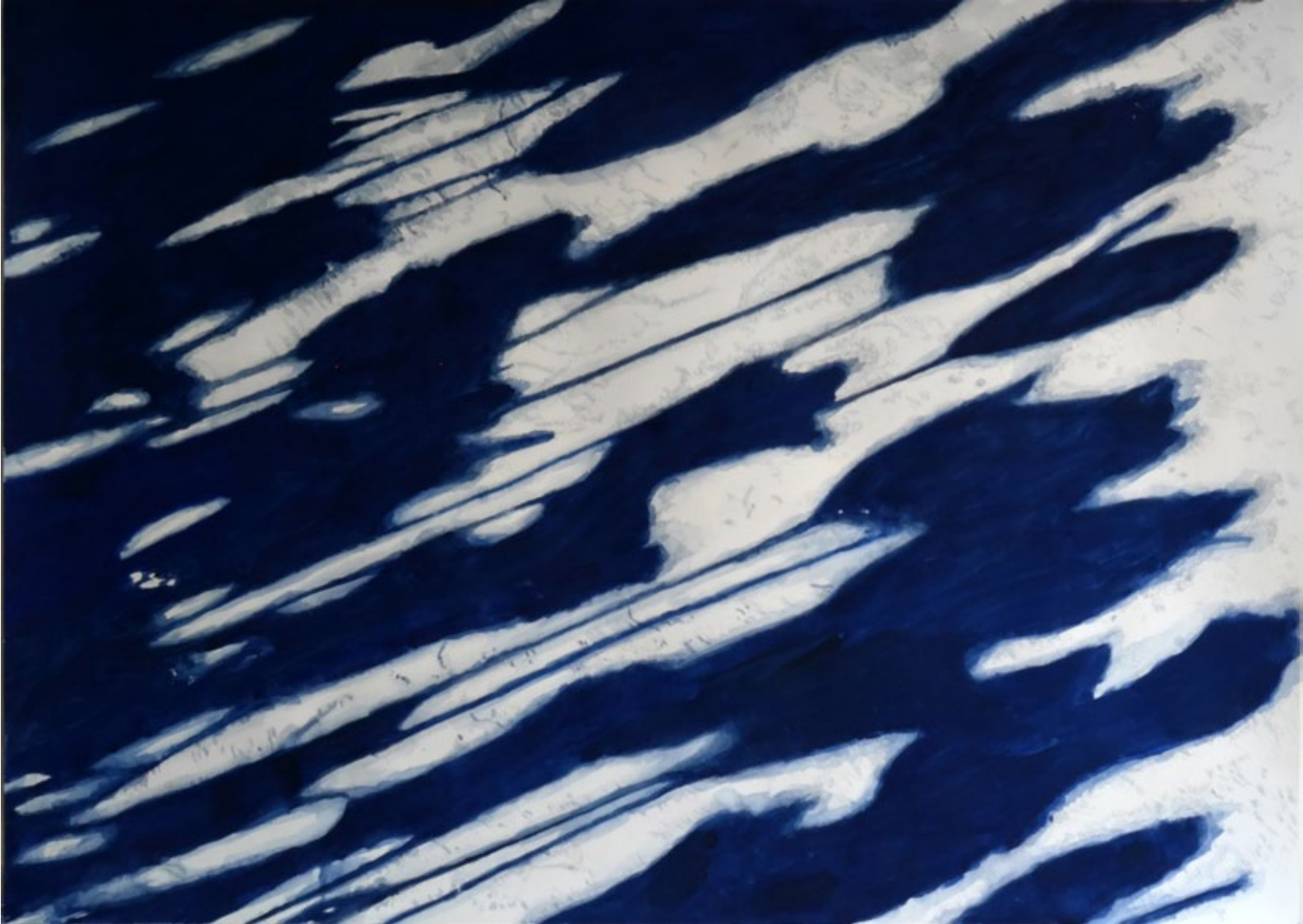
SHADOWS, DUMBO, 2020, watercolor and graphite, 22 x 30 in. 55.9 x 76.2 cm.