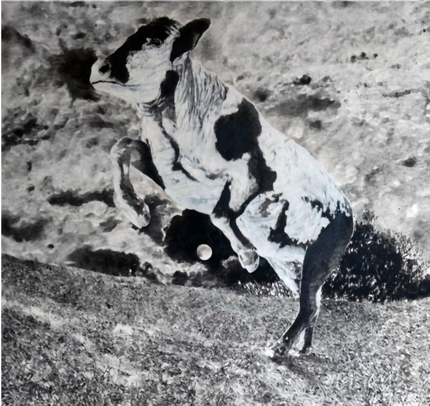
WHEN COWS CAN JUMP OVER THE MOON, 2020, oil on linen, 60 x 60 in. 152.4 x 152.4 cm.