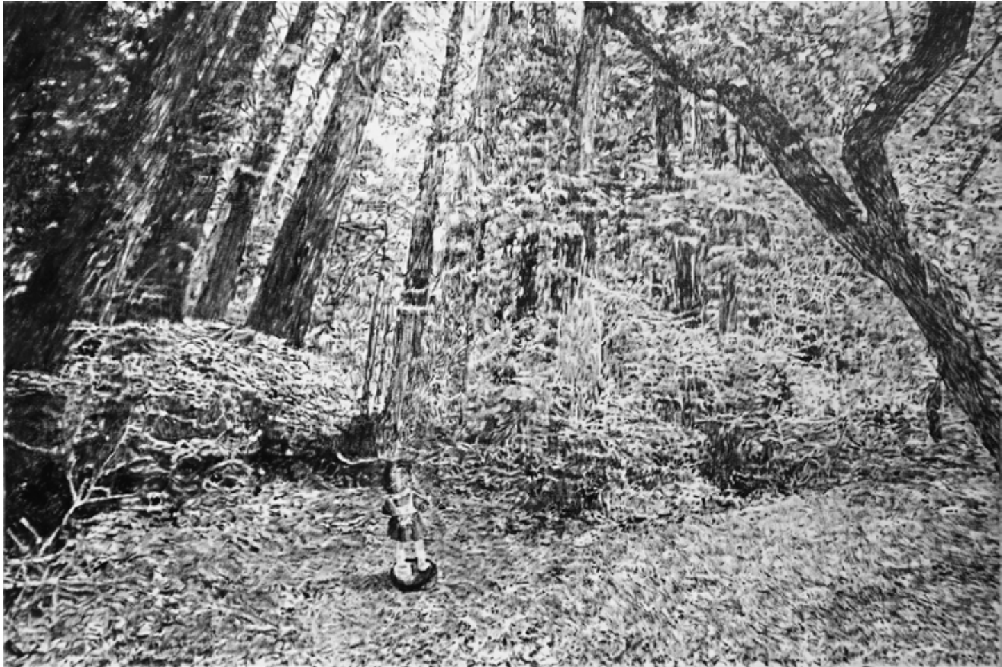
DESPITE, 2017, oil on linen, 16 x 24 in. 40.6 x 61 cm.