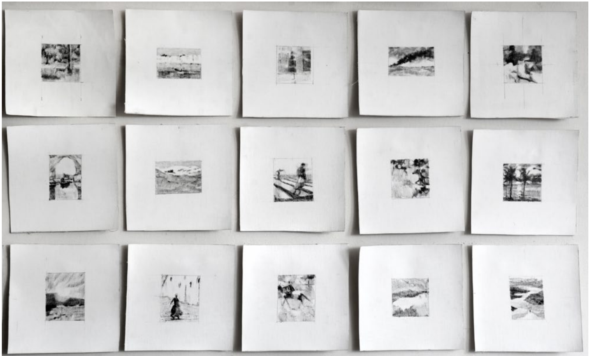
IN PROGRESS: THE STAMP WORKS AT THE ARTIST'S STUDIO, 2020