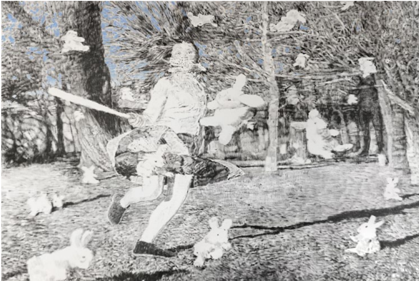
EVERYWHERE, 2019, oil on linen, 16 x 24 in. 40.6 x 61 cm.