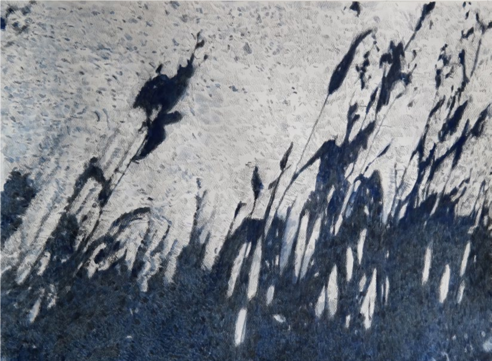
SHADOWS, RED HOOK, 2020, watercolor, graphite, and oil on linen, 22 x 30 in. 55.9 x 76.2 cm.