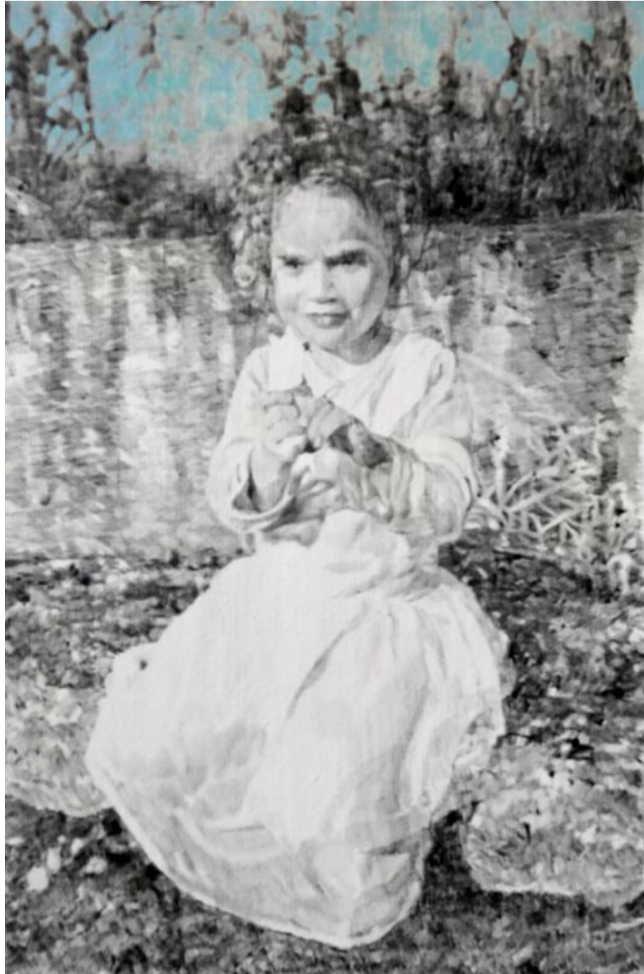
*#&$ (STRING OF EMOJI ICONS), 2019, 24x16 in. 61 x 40.6 cm.