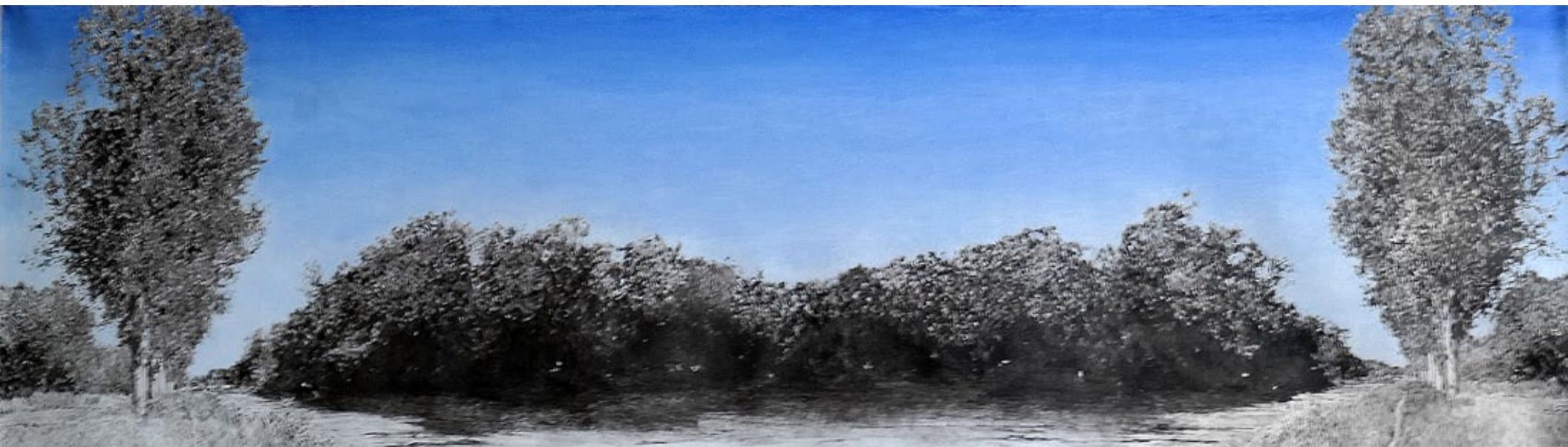
THE DISTANCE BETWEEN US, 2020, oil on linen, 18 x 64 in. 45.7 x 162.6 cm.