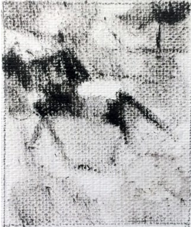
STAMP: COWBOYS, 2020, oil on linen, 1.5 x 1 in. 3.8 x 2.5 cm.