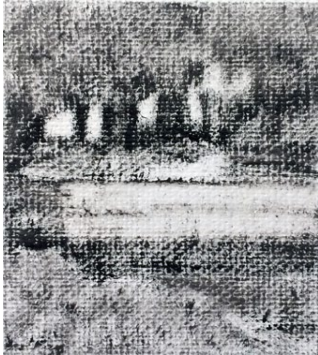
STAMP: CURB AT PARK LANE CORNER, 2020, oil on linen, 1.25 x 1.25 in. 3.2 x 3.2 cm.