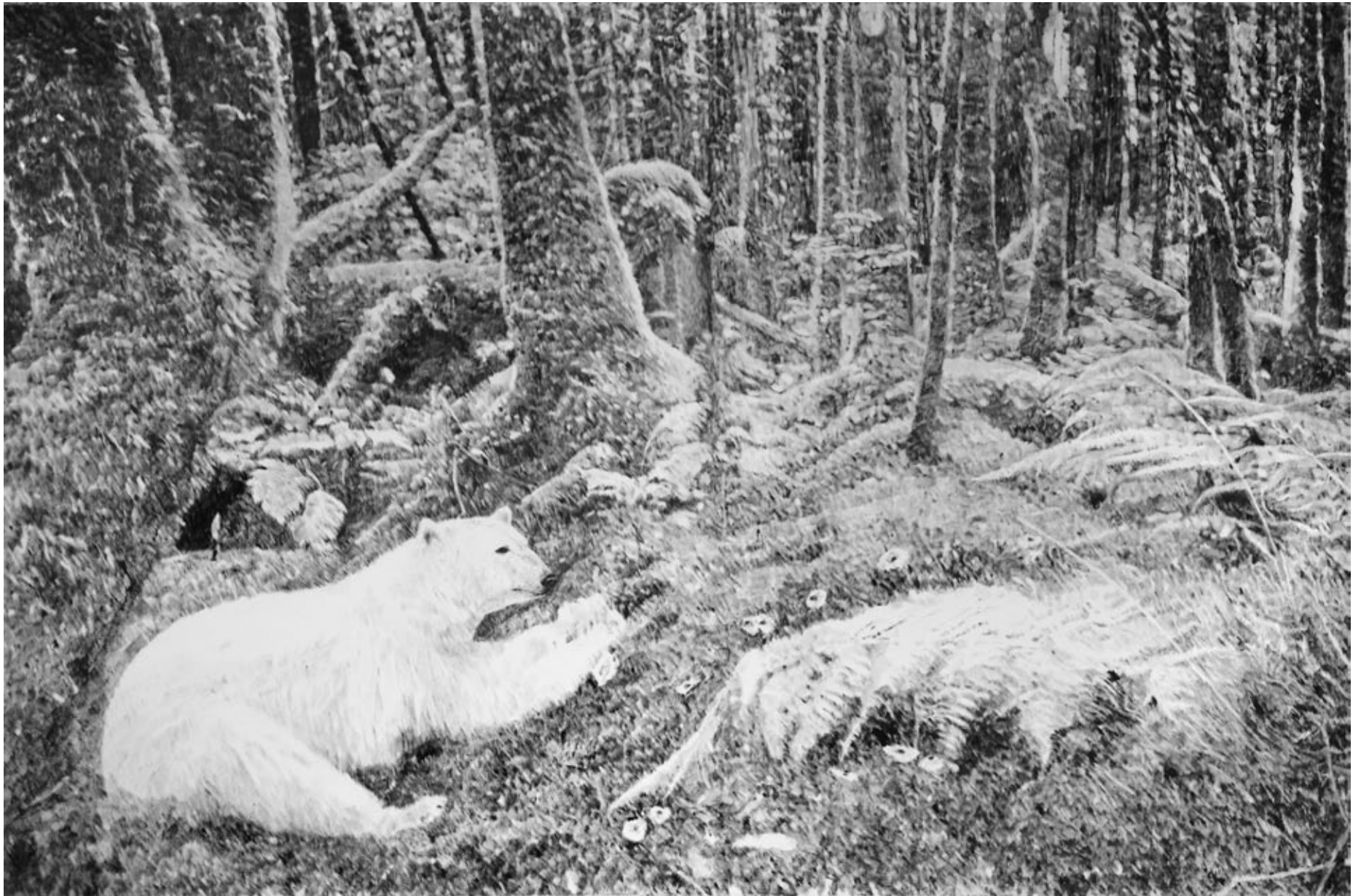
BEARING THE WOODS, 2013, oil on linen, 48 x 72 in. 122 x 183 cm.