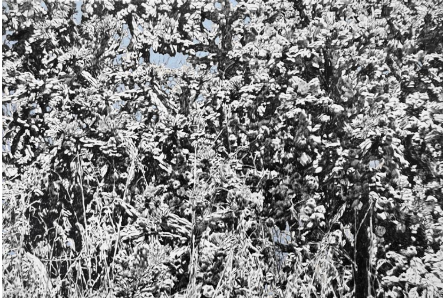
ON THE PATH TO HERE, 2019, oil on canvas, 16 x 24 in. 40.6 x 61 cm.