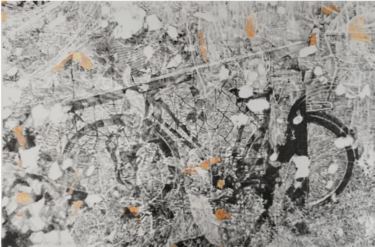
LOOKING THROUGH THE GUISE, 2019, oil on linen, 16 x 24 in. 40.6 x 61 cm.