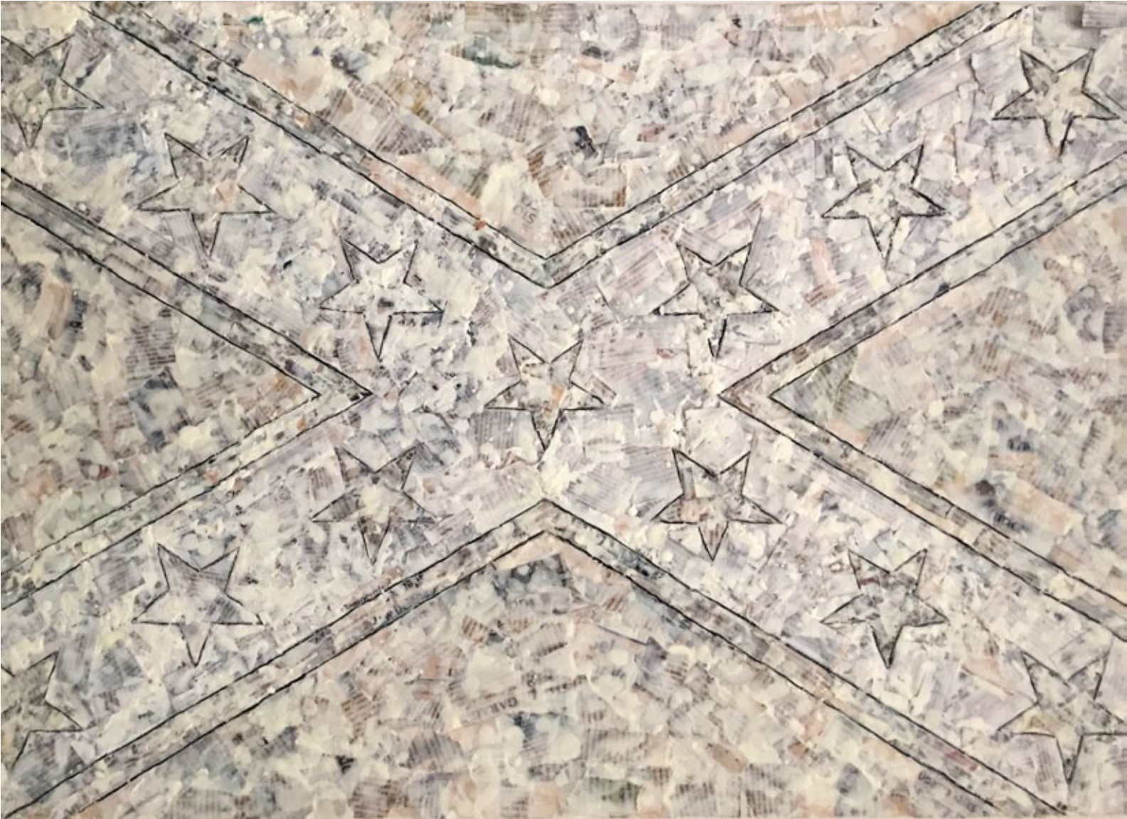
WHITE, 2018, encaustic, 28 x 36 in. 71.1 x 91.4 cm.