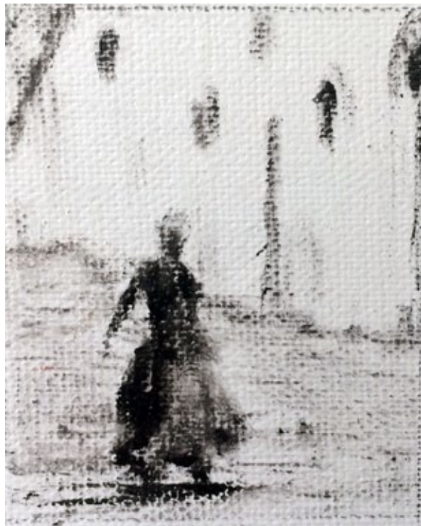
STAMP: GIRL IN A HURRY, 2020, oil on linen, 1.5 x 1 in. 3.8 x 2.5 cm.