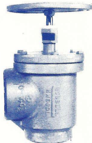
6" ANGLE VALVE SHOWN.

VALVE SIZES 5" THRU 14" ARE WELD-IN ONLY. "HUBBELL" IS CAST INTO VALVE BODY, AND ANY NUMBERS FOUND ON BODY CASTING ARE TO BE DISREGARDED. CATALOGUE NUMBERS ARE FOUND IN PACKING NUT AREA. COLOR:GRAY