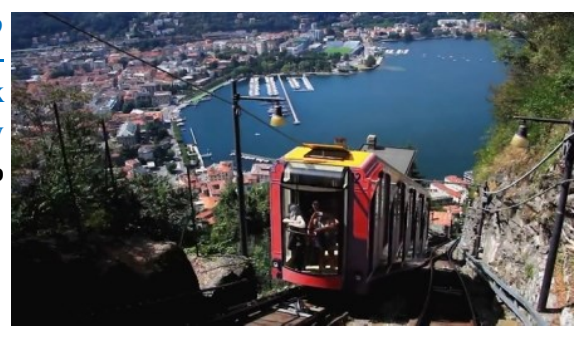
Day 5 — Como / Bellaggio

Perhaps this evening, for those still energized you can take a walk over to the Funicular for a ride up to Brunate to view the scenery from high above the Lake. The funicular operates every day from 6.00 am to 10.30 pm.