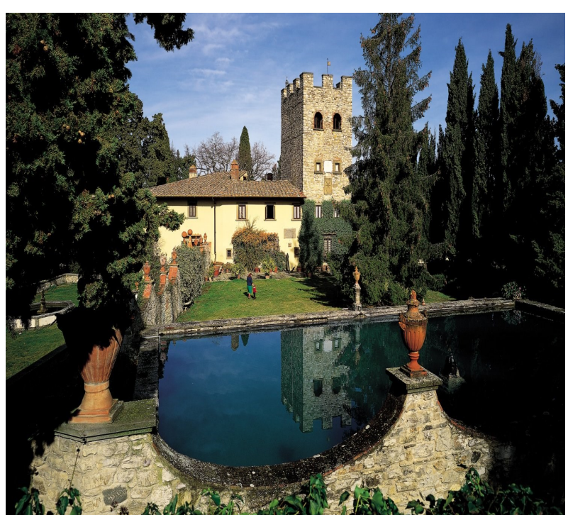
Wine tasting lunch (included) supper on your own. (B,L)

Prior to lunch we will have a guided tour of the Castle cellars and wine rooms, some dating back to the 16th century.