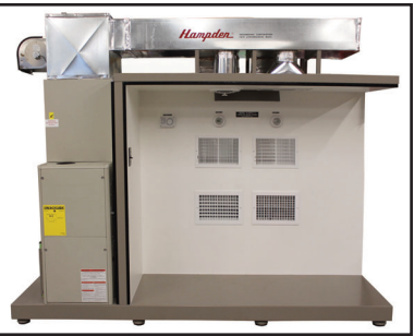
H-FAHT-1-G-A Forced Air Heating Trainer with Summer Air