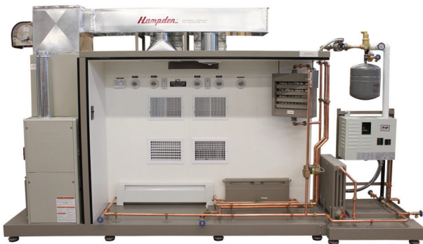
Model H-AHST-D3 Air/Hydronic: Gas/Electric with Summer Air