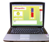
◀ Model H-DHPS-CSI