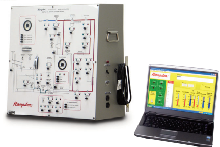
Model H-DOHS-CSI ▶