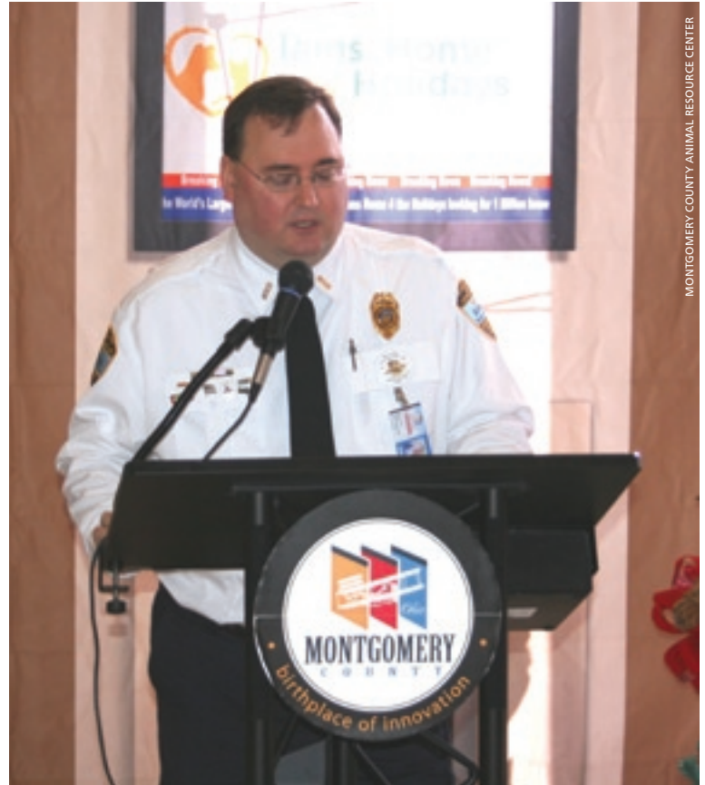
MONTGOMERY COUNTY ANIMAL RESOURCE CENTER