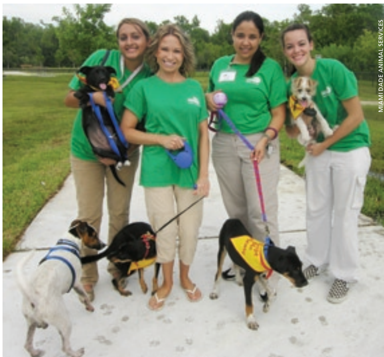
MIAMI DADE ANIMAL SERVICES