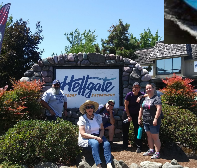
Our Fearless Leaders!!