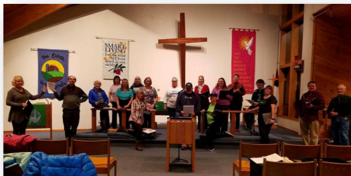
Rehearsing for Carol Dickens' Christmas