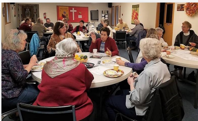
November Senior Social

In the busyness of preparing for Christmas, take a couple hours off on Thursday December 21 st , and treat yourself to lunch out! The Lunch Ladies will be preparing a special hot meal, complete with all the "trimmings." Special entertainment will bless us all. Do you have a "special" Christmas sweater or shirt? Let's dress up in our finest!! We are hoping to help fill the "Food Bank" shopping cart with canned goods. Please add a few extra gifts of food to your grocery list and bring them on December 21 st . May this time together be a blessing to all! See you at noon on Thursday, December 21 st .