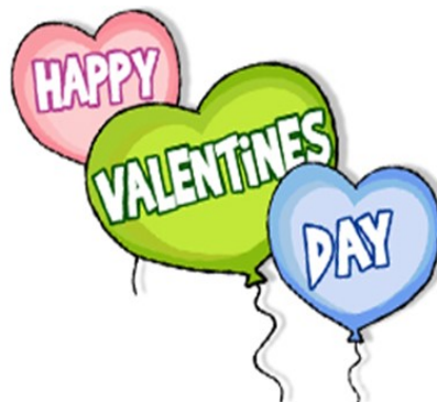
February 14, 2017