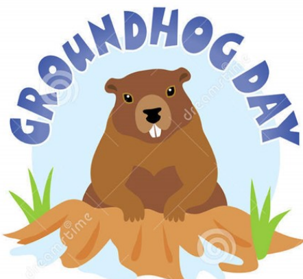
February 2, 2017

As labor, we must also support our teachers in the field. Public education is under attack. Education is the great equalizer, the profession that makes all professions possible. Every child deserves a quality public education. Thank you to our teachers for supporting us in "Stopping Staples". I know you can count on us to protect public education as well. Remember, an educated society is the foundation of a strong United States of America.