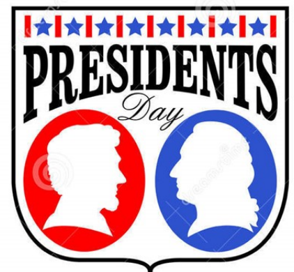
February 20, 2017