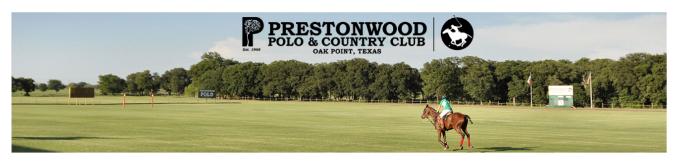
402 Prestonwood Polo Drive, Oak Point, Texas 75068