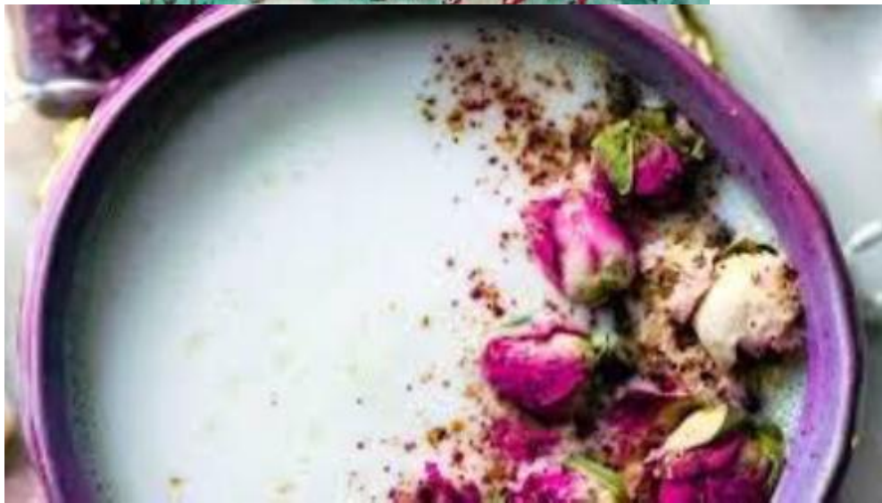
This lovely Rose Cardamom Moon Milk from tinylagunakitchen is truly magical. After just a sip, you'll dance with the dream-fairies!

I admit that I've been quite captivated by the rainbow of colors, the inventiveness of the embellishments, and the promise of the health-giving ingredients in moon milks. At a certain point, though, I started to wonder. How would I actually drink a beverage with so many rosebuds floating on top? What exactly are these mysterious herbs and adaptogens? And how important is it, really, for me to drink pink, blue, purple, or green milk? I knew I needed to get back to basics.