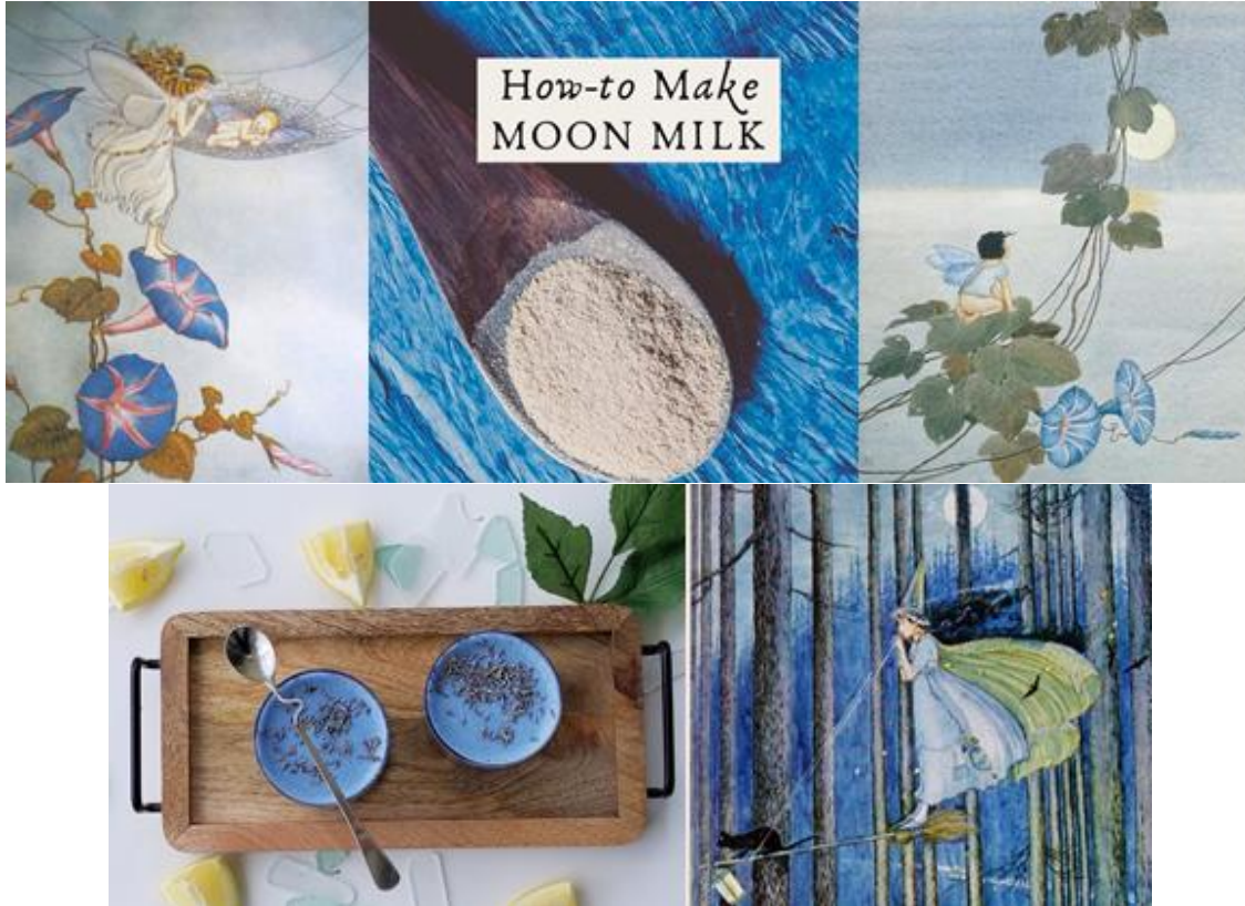
Three charming sleepy-time images by New Zealand artist Ida Rentoul Outhwaite (1988 - 1960) flank a spoonful of powdered ashwagandha and a duo of "Once in a Blue Moon" butterfly pea flower moon milks.

Astragalus is another herb that some people add to moon milk to increase their stamina, strength, and vitality. Astragalus membranaceus is better known in Traditional Chinese Medicine, having been used medicinally in China for at least 2,000 years.