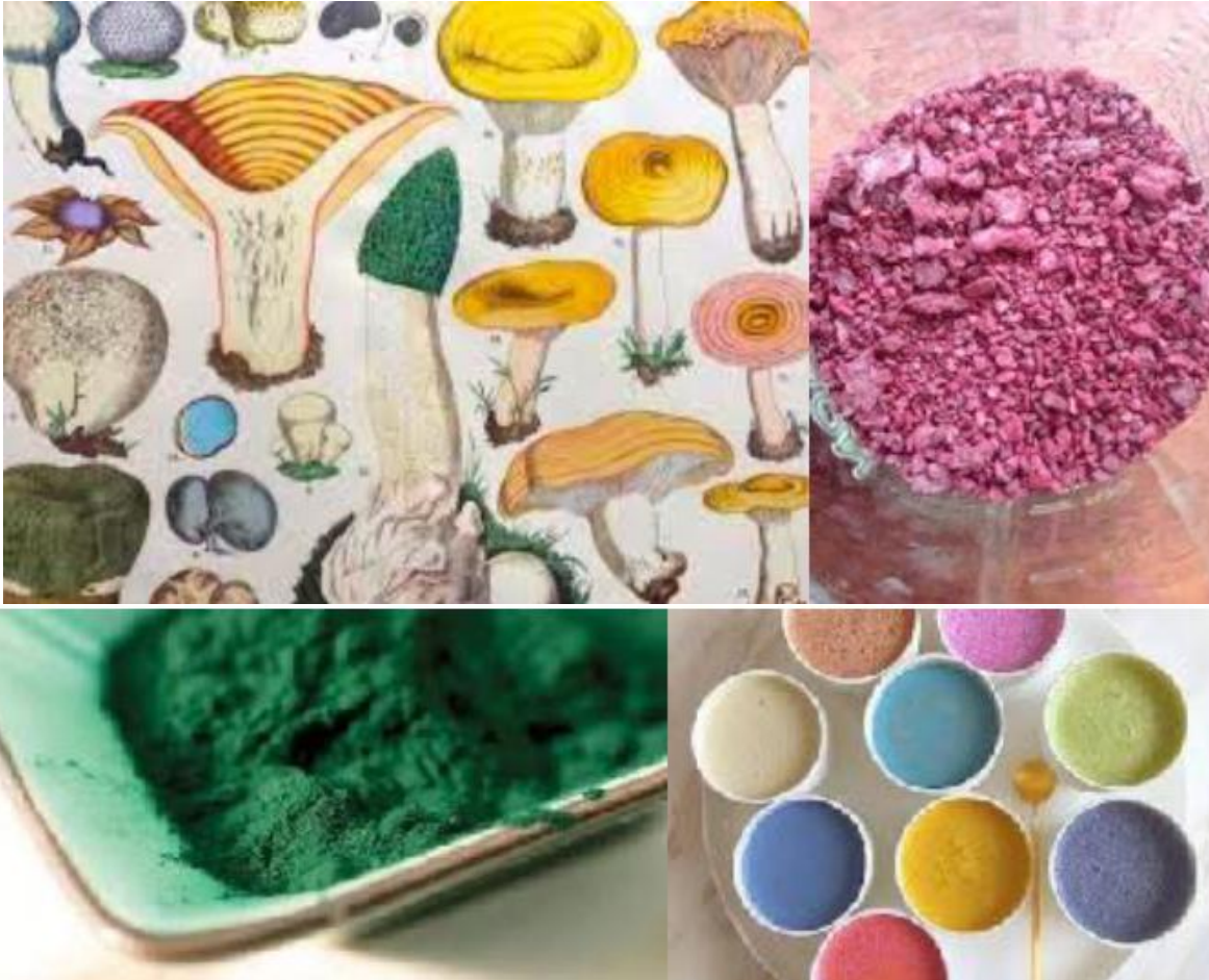
Clockwise, from top left: This lithograph of colorful fungi is from a German Botanical Atlas published c. 1890; followed by shimmering beetroot powder, an assortment of moon milks to please all "palettes", and vibrant forest green spirulina

With that said, let's look at some of the other ingredients - not necessarily Ayurvedic - that some people are adding to their moon milk. For starters, many people add adaptogenic mushrooms, particularly reishi, chaga, and Lion's Mane.