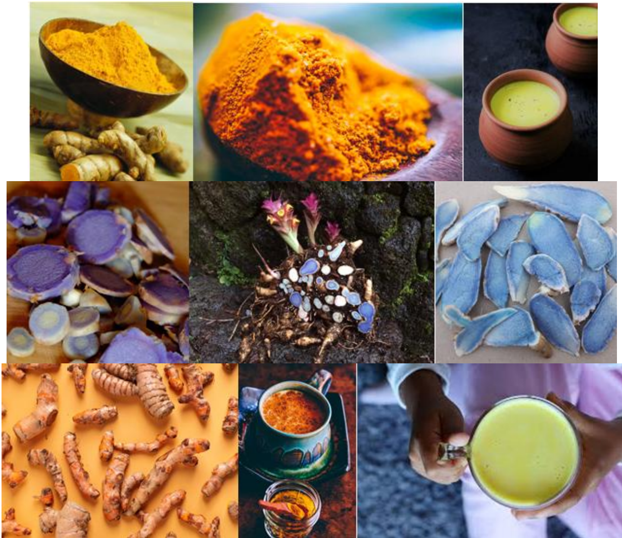
The many colors of turmeric - "Black turmeric" ( Curcuma caesia ), pictured in the center row, was listed as an endangered species by the Indian Agricultural Department in 2016.

longstanding ethnobotanical value in Ayurvedic medicine. Its indiscriminate harvest for superstitious as well as medicinal purposes has caused a precarious decline in its population.