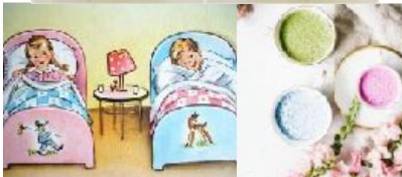
A Japanese ceramic Whistle Mug from the 1950s, a sweet illustration from a child’s book, and a lovely selection of pastel moon milks add up to a dreamy bedtime...

Since we have our own tradition of drinking warm milk here in the Western World, it shouldn’t be hard to adjust to Ayurvedic milk-based beverages. There are just a few suggestions to make it easier.