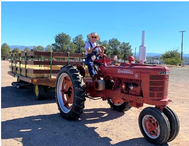
Show photo2 2022