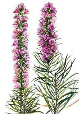
Liatris spicata--Blazing Star, AKA "Gayfeathers"