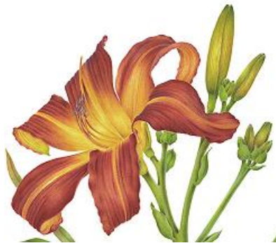
Hemerocallis fulva—Tawny Daylily, AKA “Ditch Lily”