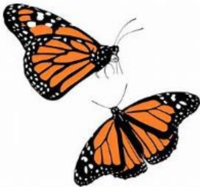
Monarch Butterfly. . .plus two ubiquitous flowers of a New England midsummer: