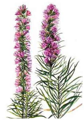
Liatris spicata--Blazing Star, AKA "Gayfeathers"