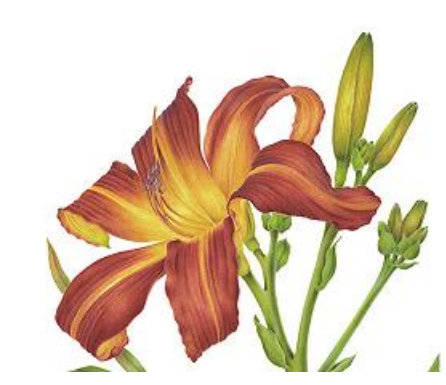
Hemerocallis fulva—Tawny Daylily, AKA "Ditch Lily"