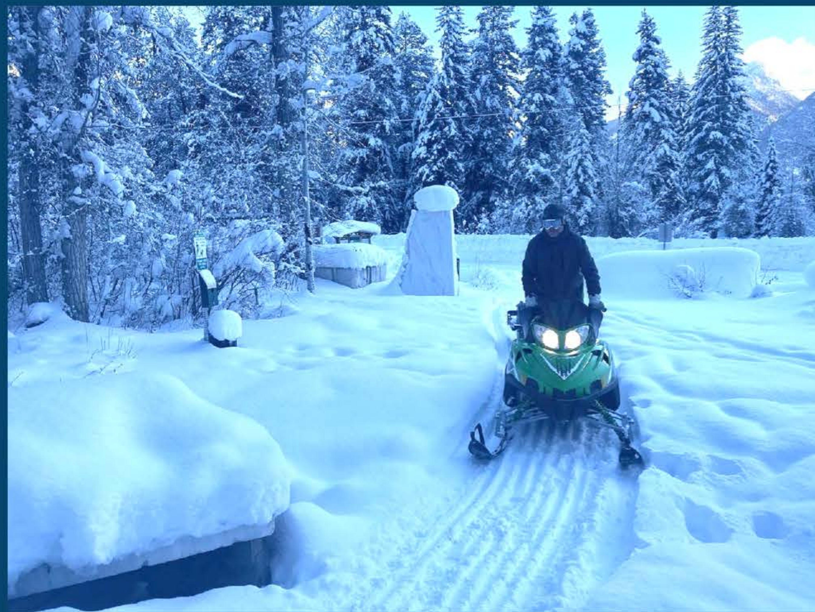
Big thanks to Richard Wells and Jason Rusby for grooming the Mill Site park!

The Town of Marble is forming a special committee to update its existing Master Plan. A professional facilitator will assist the committee to focus on key areas relevant to the future of Marble. The committee will meet monthly for one year to develop a ten year Master Plan. Public meetings will be held and facilitated through the year to hear the visions and hopes from the community. All are encouraged to apply within the 3 mile radius of Marble's town limits. The applications can be found on the front page of the town's website. The current Master Plan is also on the website. Deadline to apply is March 1, 2023. If you are unable to join the committee, please attend meetings. Everyone's input in this process is of great value.