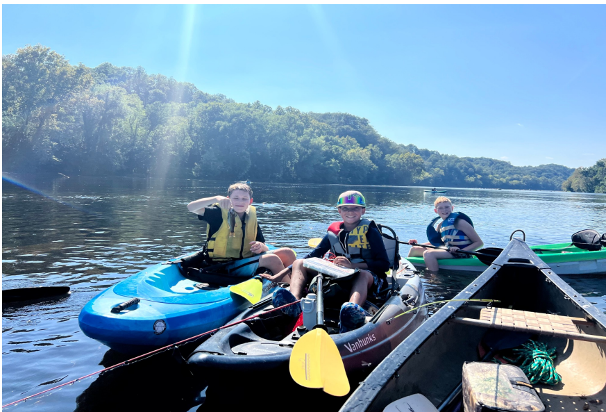
Dickle Kids Floating and Fishing, Labor Day, 2023