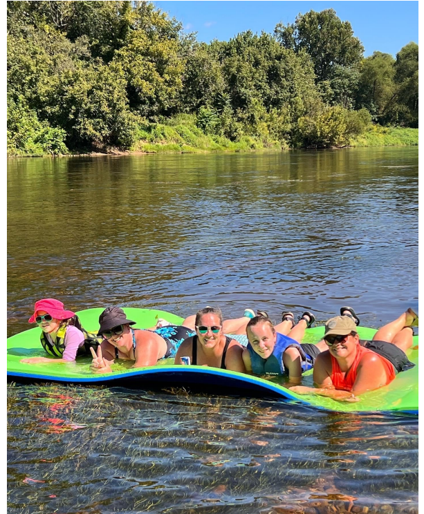
Some Dickels lounging during labor day paddle 2023, Courtesy of Mary Bias