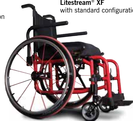
Litestream® XF with standard configuration