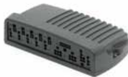
Advanced Actuator Module (AAM)