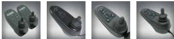
NE and NE+ PG VR2 (4-key) PG VR2 (6-key) PG VR2 (9-key)