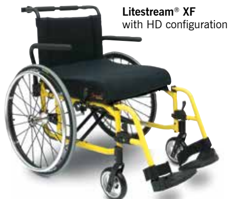
Litestream® XF with HD configuration

The Litestream® XF ultralight manual wheelchair uses a unique, innovative, rigidizing double X folding frame that delivers the versatility and performance of a rigid frame while folding to a width of only 9" for easy transport. The Litestream XF accepts a broad selection of accessories to meet a wide variety of needs and personal preferences while remaining an excellent overall value. The Litestream XF is also available in an HD configuration that weighs just 35.5 lbs. and features a cane-to-cane rigidizing bar for added stability.