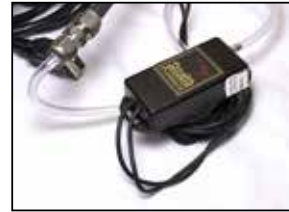
Stealth i-Drive™ i-Connect™

Using mechanical switches that may be hard for a client to press or reach? The i-Connect™ provides the capability to utilize fiber optic or proximity sensors for mechanical switch functions with standard mono-inputs. Add versatility and function to your switch controls and get connected today!