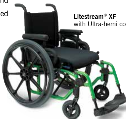
Litestream® XF with Ultra-hemi configuration