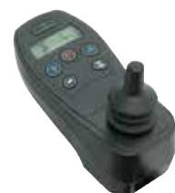
Q-Logic 2 NE+