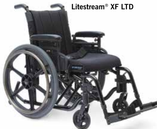
Litestream® XF LTD

The Litestream® XF LTD ultralight manual wheelchair uses a unique, innovative, rigidizing double X folding frame that delivers the versatility and performance of a rigid frame while folding to a width of only 9" for easy transport. The Litestream XF LTD accepts a broad selection of accessories to meet a wide variety of needs and personal preferences while remaining an excellent overall value.