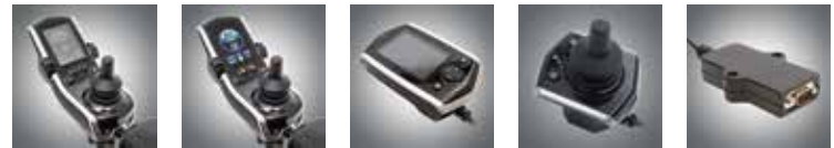
Q-Logic 2 EX Joystick Q-Logic 2 EX Joystick with Lights Q-Logic 2 EX Enhanced Display Q-Logic 2 EX Stand Alone Joystick / EX Attendant Joystick Q-Logic 2 Specialty Controls Interface Module