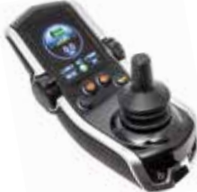
Q-Logic 2 EX Joystick for LED lights