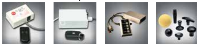
ASL Remote Stop Switch Switch-It Remote Stop Switch ASL Remote Attendant Control Joystick Handles