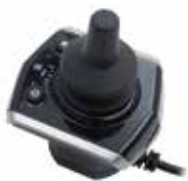
Q-Logic 2 EX Stand-Alone Joystick (SAJ) / EX Attendant Joystick