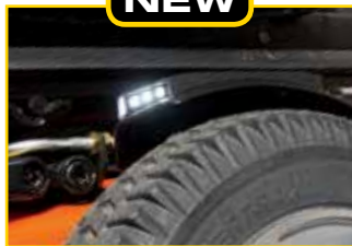
LED FENDER LIGHTS