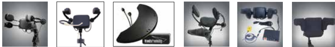
Stealth i-Drive™ Tri-Array Stealth i-Drive™ Sip 'n' Puff Stealth i-Drive™ Fiber Optic Tray Array 3-Switch Stealth Ultra Head Array ASL 3-Switch Head Array Switch-It Head Array (3, 4 or 5 switch)

* Either the Q-Logic 2 Enhanced Display or Q-Logic Enhanced Display is still required for Sip N' Puff and single switch driving.