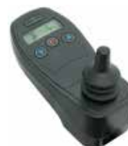
Q-Logic 2 NE