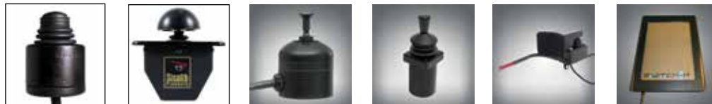
Stealth i-Drive™ Mini Proportional Joystick Stealth Mushroom Joystick ASL Micro Extremity Control Switch-It Proportional Joystick ASL Rim Control Switch-It Touch Drive