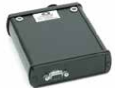
Environmental Control Unit (ECU)