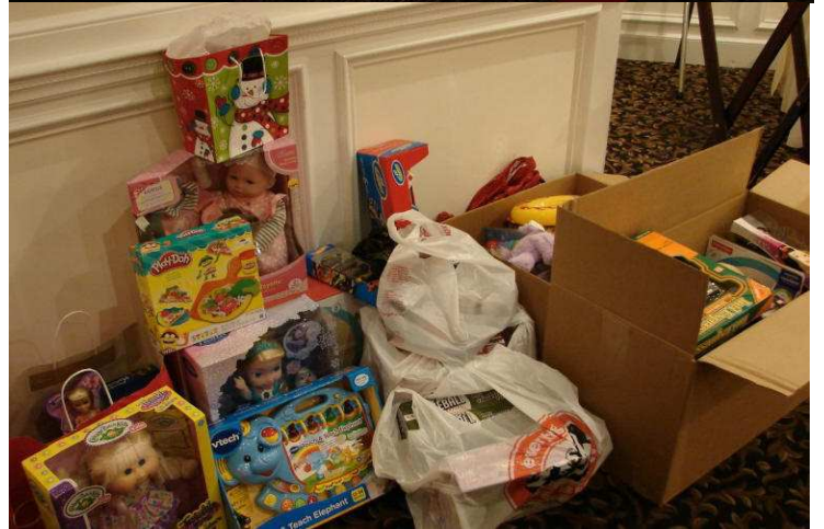
Toys for Tots Donations