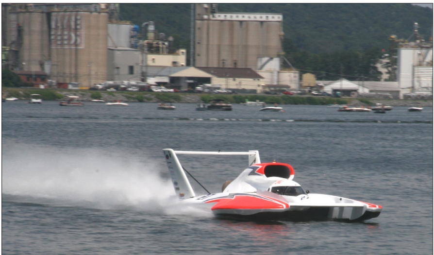
The U-27 tests on Lake Guntersville.

the Miss U.S. 1 , a record that stood for no fewer than 38 years.