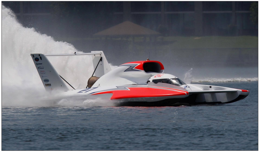
[Top] The hometown entry from nearby Rainbow City, Alabama, the U-27 owned by Charlie Wiggins, as it is prepared for a test run in Guntersville. [Middle] The U-27 as it is being lowered to the surface of Lake Guntersville. [Above[ The U-27 during its test run with Cal Phipps at the controls.