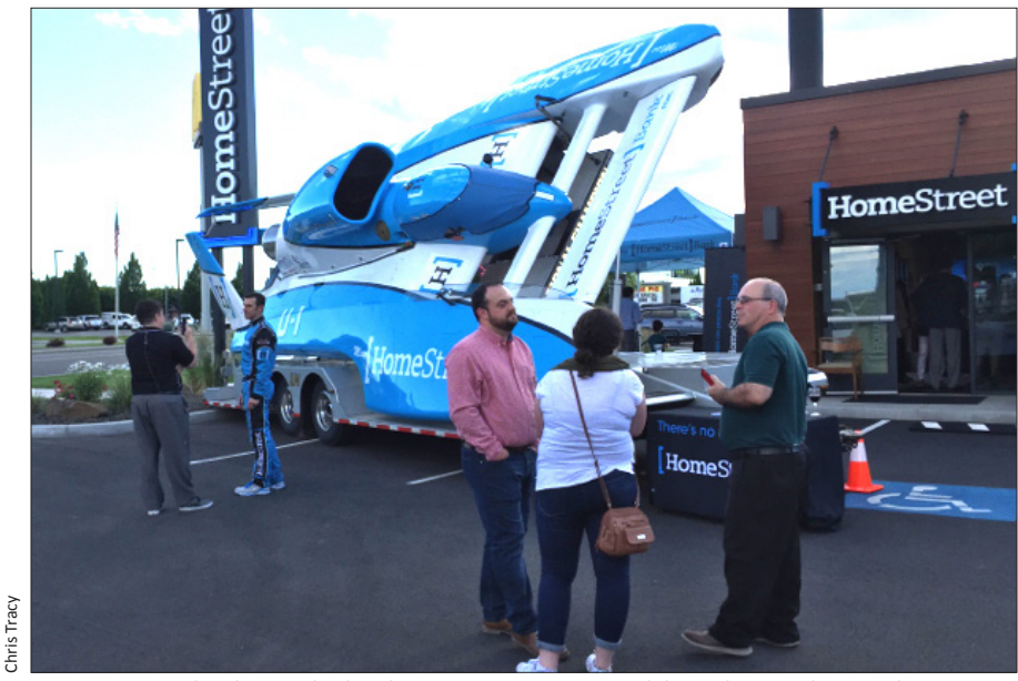
Appearances by the U-1 hydroplane at HomeStreet Bank branches, such as at this one in Kennewick, Washington, are a staple of the company's sponsorship effort.

But, maybe more important, he delivered a clear message that all teams sometimes need additional expertise and help. The Unlimited NewsJournal had heard that Hydroplanes, Inc., was closing its shop outside of Seattle. This is the former Budweiser shop that the