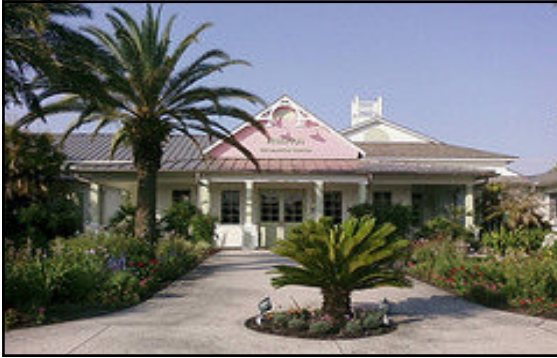
MEETING PLACE OF THE VILLAGES SHRINE CLUB Hibiscus Recreation Center 1740 Bailey Trail, The Villages, FL