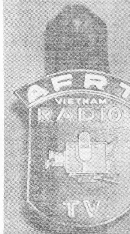
Armed Forces Radio-TV insignia