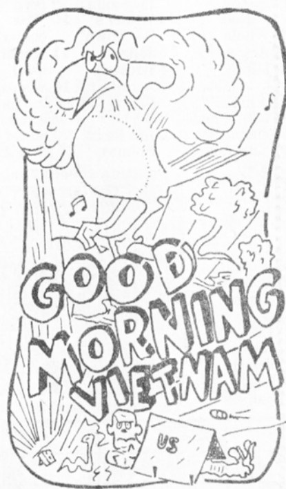
The show's logo from a 1966 edition of "Stars and Stripes," an Armed Forces newspaper.