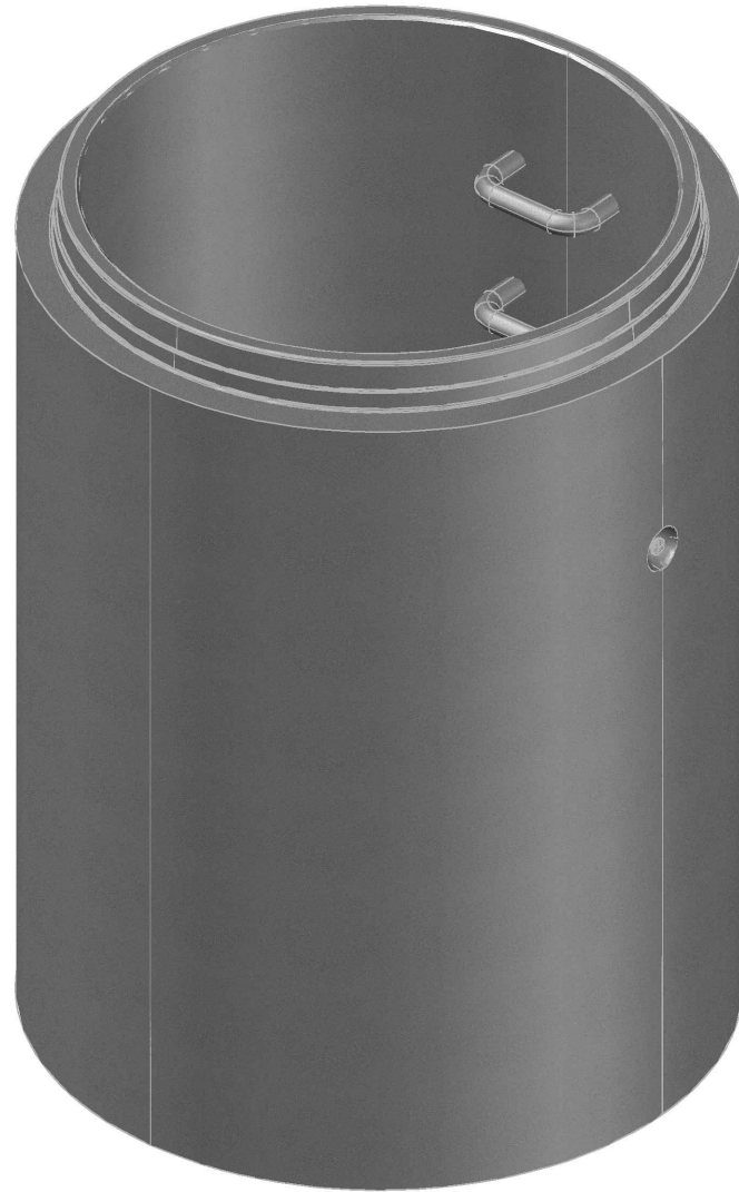
ISOMETRIC VIEW NTS