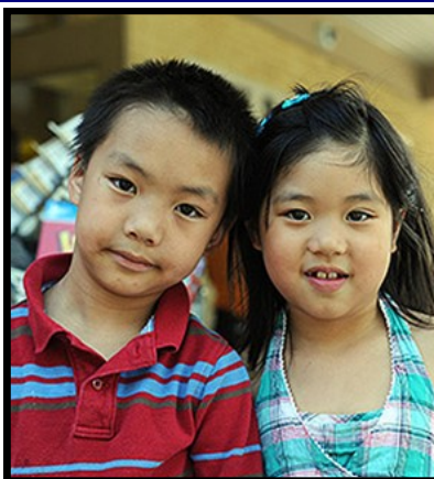
Auxiliary News and Views