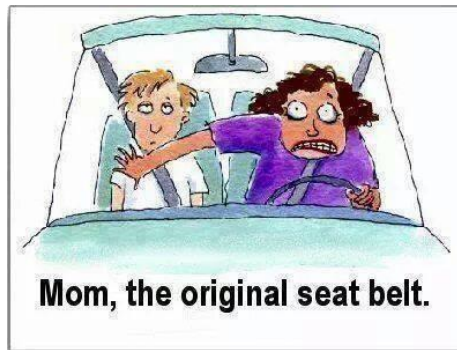
HAPPY MOTHER'S DAY