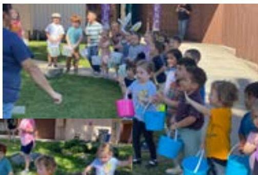
Above and left: Preschool Easter Egg Hunt