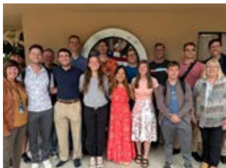
Above: Air Force cadets from the Navigators Ministry spoke to the middle school students.