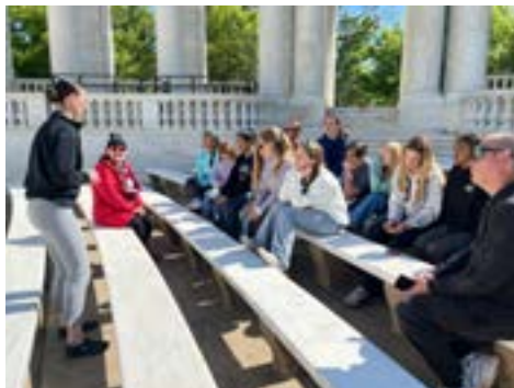
Above: The students got a special opportunity on this trip. The woman on the left is a soldier from the tomb of the unknown soldier. She is only one of seven women to hold this position.