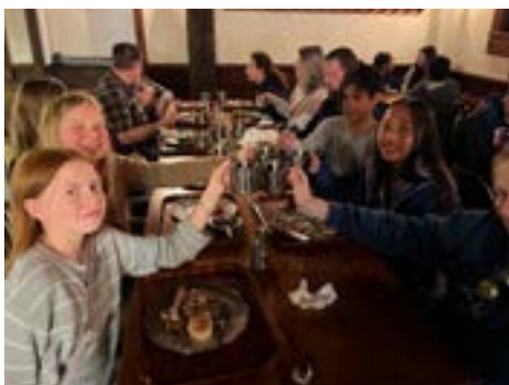
Above, below & right: Seventh- and eighth-graders go to Washington, D.C. and other historical places.