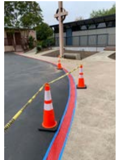
Left: The new fence Verizon paid for to separate their access road from the school grounds.