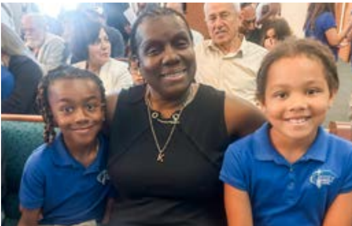
Below: Grandparents Chapel

Our seventh- and eighth-grade students had the incredible opportunity to travel to our nation's