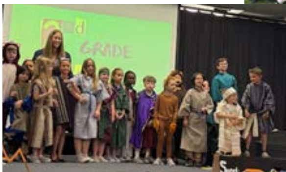
Left and below: Second grade chapel