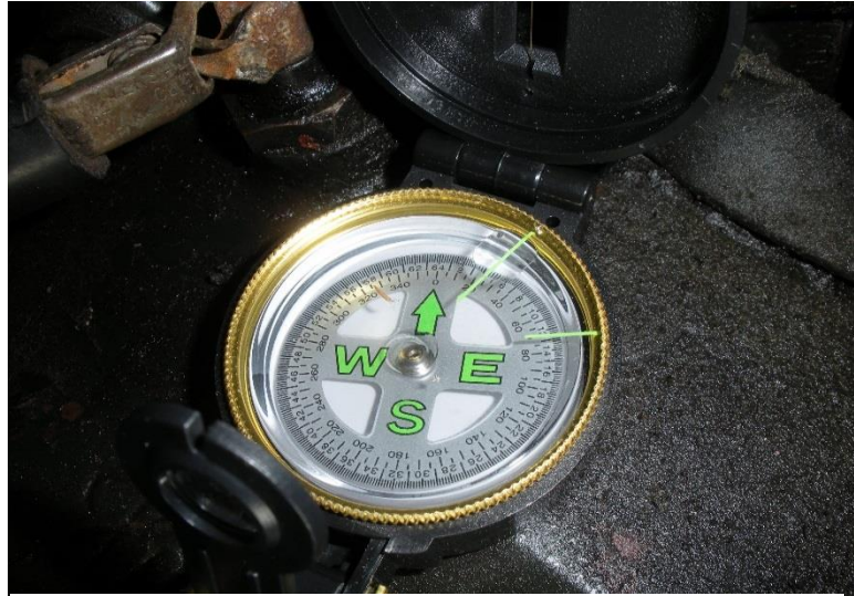
Compass is pointing to zero degrees, indicating magneto is aligned to a north magnet pole.

Remove the jumpers, reinstall the spark plugs, and reconnect the magneto output wire. Start the car and re-measure AC voltage from the magneto output post to ground. I ended up with ~25 Vac at idle, and I believe that Gene's was the same or better!