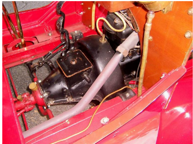
Early Model T with two foot pedals.

The first Model T's built in 1908/09 had only two foot pedals. Reverse was operated with a floor-mounted lever instead of a pedal. Ford later offered a $15 upgrade to convert those cars to three floor pedals. The Gilmore Car Museum in Hickory Corners, MI has a two-pedal T on display. You can read more about the museum and their Model T driving school in the latest issue of the Model T Times.