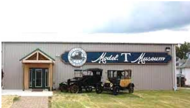
Model T Museum in Richmond, IN