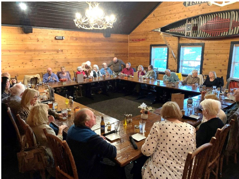
Club members enjoyed the annual banquet held at Thunder Bay Grill on October 23rd.