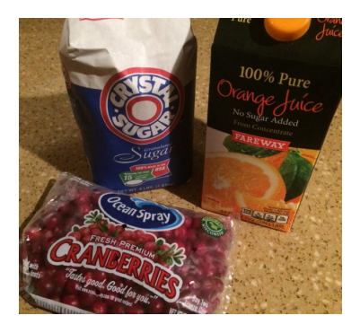
Ingredients all layed out

Set a timer and forget about it. Focus on all the other things you have to do. How easy is that?! Then, when the alarm goes off, turn the crock pot off, allow to cool. Garnish with whip cream, and chopped pecans to your liking.