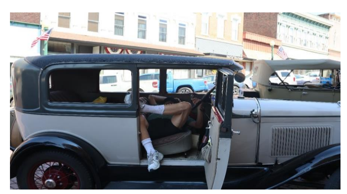
Mt. Carrol is a sleepy little town, as Wayne proved!

reserved parking right in front of the Mad Hatter Antique Shop. They provided complementary water or coffee, which was most appreciated. What a fun stop in a nicely preserved little town. So much to see and there were several food choices available. Our parking on Market Street was also perfect since we had shade, making it very comfortable as we browsed the shops and sat outside, where seating was plentiful, until it was time to resume our tour.