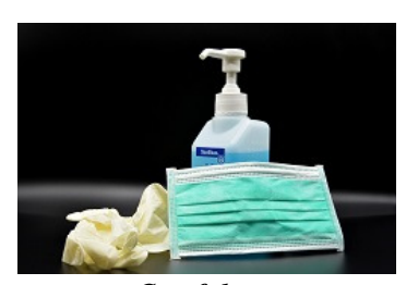
Carefulness costs you nothing.

Your card number may have stayed the same but your expiration date may have changed. Check your card number and expiration date for accuracy in XpressBillPay prior to your next payment or autodraft.