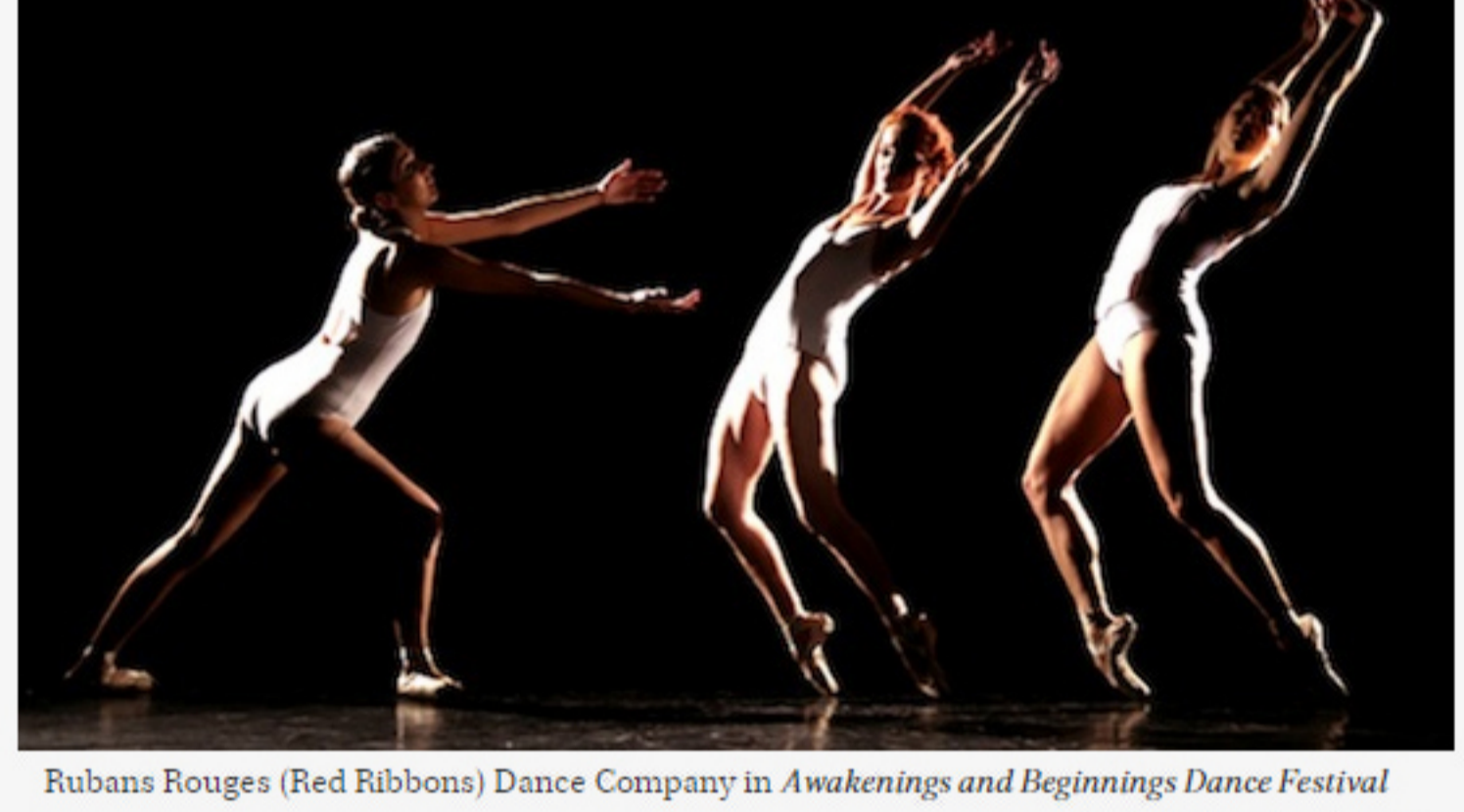
Rubans Rouges (Red Ribbons) Dance Company in Awakenings and Beginnings Dance Festival