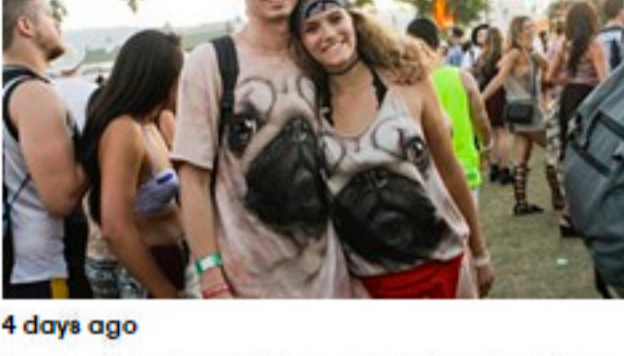
4 days ago Coachella's Most Eyebrow-Raising Fashions