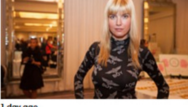
1 day ago Stars and Swag of the MTV Movie Awards