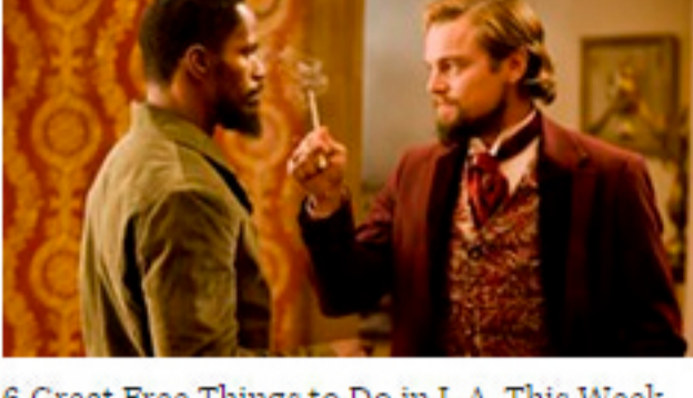
6 Great Free Things to Do in L.A. This Week By L.A. Weekly | 3 hours ago