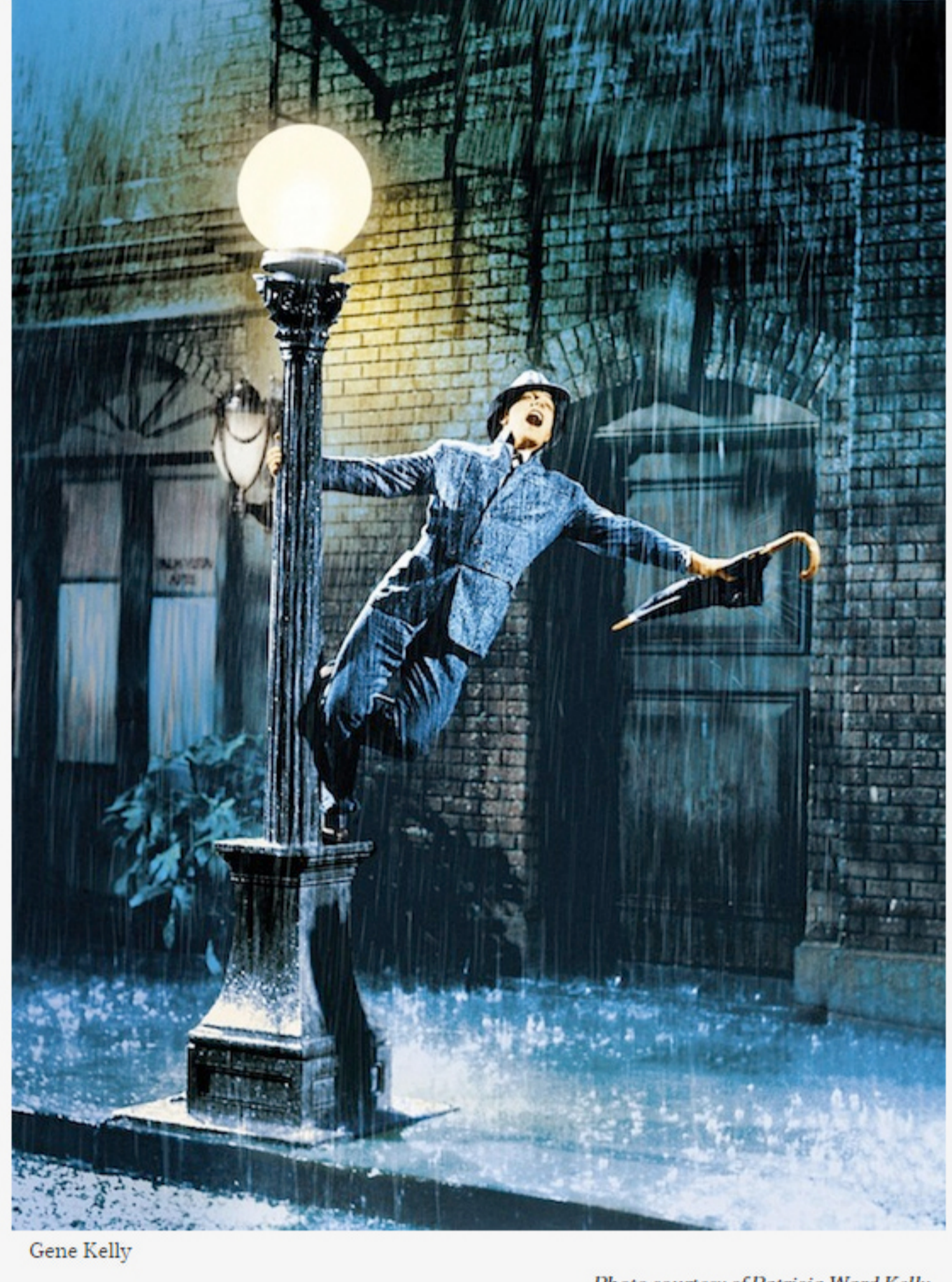
Gene Kelly