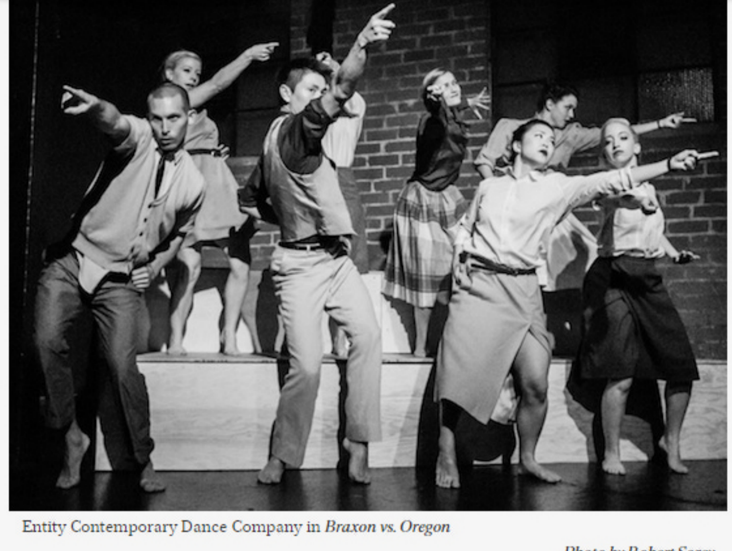
Entity Contemporary Dance Company in Braxton vs. Oregon

This week's dance events include a celebration of Gene Kelly, a festival showcasing local dance and a dance drama about assisted suicide.