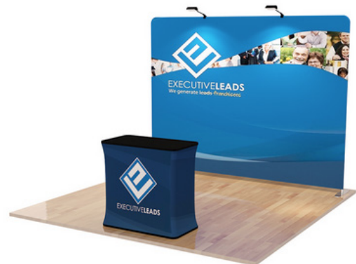
*Podium optional - Wood floor not available

Discount of 15% for GGW members Silver & above!