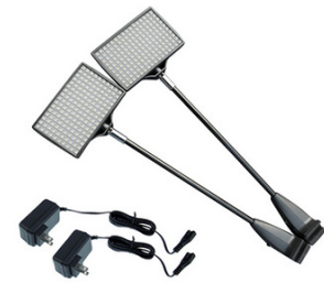
2 LED lights included in this package