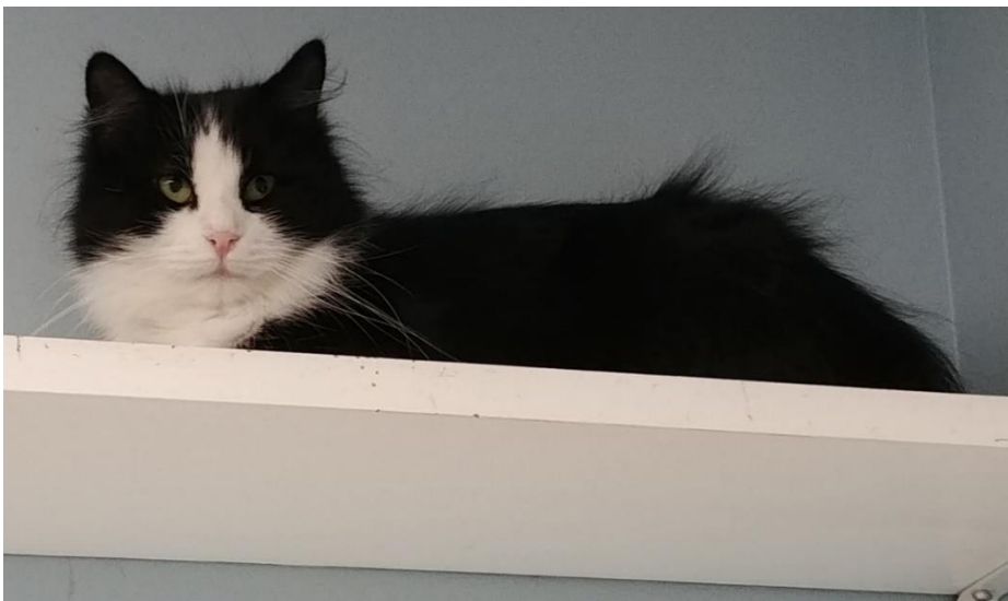
Above and Right: Buttons and Lasagna, captured last summer and recently adopted.