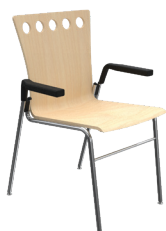
GO-4S A : 16" C : 18" E : 17"