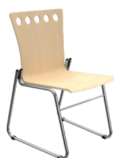
GO-2S A : 16" C : 18" E : 17"