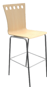
GO-8 A : 16" C : 30" E : 17"