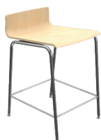
GO-9 A : 16" C : 24" E : 5"