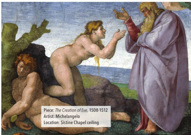
Piece: The Creation of Eve, 1508-1512 Artist: Michelangelo Location: Sistine Chapel ceiling

Do I celebrate all the good things my spouse or loved ones offer me? Do I thank them?