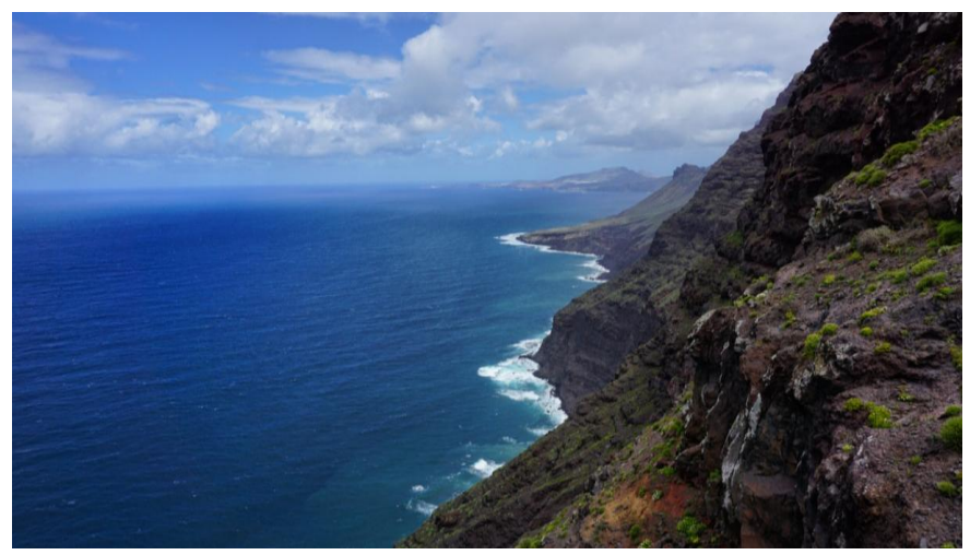
La Palma Island in the Canary Islands

Another concern is the San Andreas fault, which according to Billy, will inevitably cause much destruction. The quake will not only have a negative impact upon San Francisco, but also Los Angeles, San Diego and various other places.