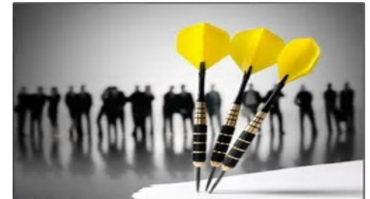
Brothers Brooks Vision 2 Mission LLC BBV2M LLC

Our Values —It is the how we will achieve it through our behaviors and actions. This is the glue to who we are and it is also unwavering.