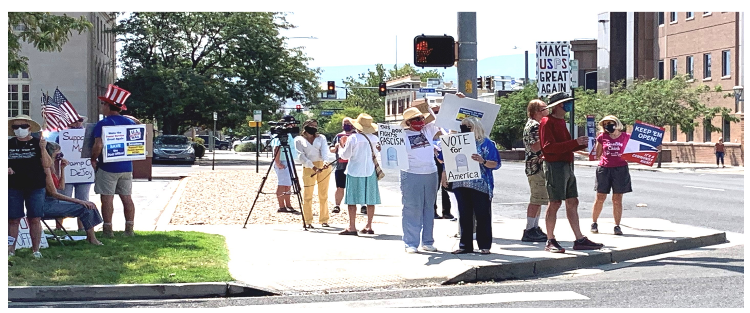
CACA at Rally 2020

Coffee and Civic Action is the group's name that manned that corner for several days, despite the weather. They have continued to write letters, make phone calls, and help rally for the preservation of the Postal Service. They are a prime example of a successful coalition between the Auxiliary and another civic group. We thank and salute their efforts to make this a better country.