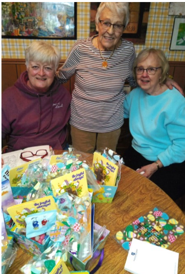
UMW members putting together Easter gifts