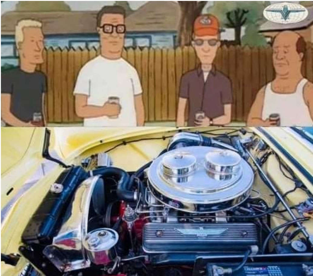
Woman don't understand that men can stand around like this for hours and be happy