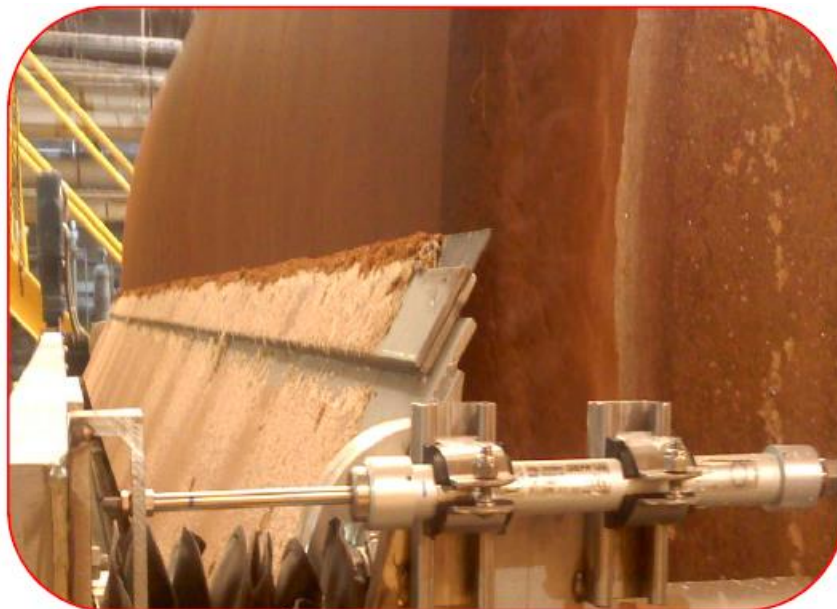
Figure 1: EDG-Trac Knife Advance System

Tristar is a manufacturer of fabricated components and equipment, including remanufactured filtration systems. The EDG-trac Knife Advance system (“EDG” stands for “encoded digital guidance”) is an ancillary system for a rotary vacuum filter, which consists of an advancing knife and associated controls. Rotary vacuum filters are used to separate solids from a liquid. In these systems, the slurry to be filtered is contained in a trough located just below the filter drum. As the drum rotates through the slurry, the liquid is pulled through the filter media on the surface of the drum via a vacuum pump and discharged through the center cavity of the drum. Accumulated solids are cut away from the surface using an advancing knife (see Figure 1). A P&ID that describes how a filtration system equipped with the EDG-trac Knife Advance is typically configured can be found in Appendix 1.