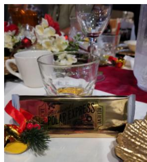
Left: Raffled items from the December Holiday Dinner.