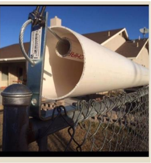
For that fence jumping dog or this can be added to your cat containment fence for those determined kitties.